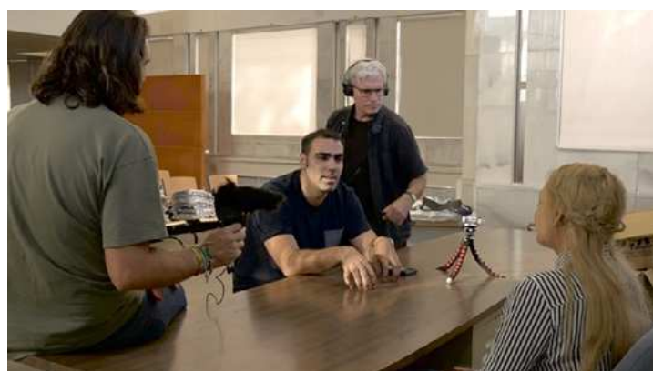
Figure 3: Frame of the recording during the fieldwork in our case study of the documentary La Primavera rosa

We count on the added value of capturing space-time of the observed phenomenon, maintaining the chronological succession of events and the recording of gestures, words and sounds. These secondary elements, which may seem insignificant at first, could later become indispensable elements in the process we study and have been recorded for our benefit. Finally, with what has already been obtained, it is possible to proceed with the crossing of recorded data, unrecorded observations, exploratory interviews, notes and interviews.