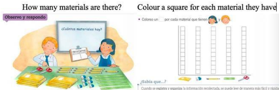
Figure 1. Example of reading level L1 “reading the data” (Source S1, p. 298)

L1. Reading the data: At this level the activity concentrates on answering questions about the frequency of a value for a variable (or the value to which a frequency corresponds), without going so far as to make other connections or perform other calculations with the data. An example is shown in Figure 1, where children should complete a bar graph to represent the frequency of a series of objects (previously classified) shown in an image.