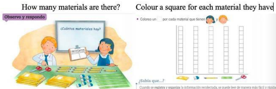
Figure 1. Example of reading level L1 “reading the data” (Source S1, p. 298)

L1. Reading the data: At this level the activity concentrates on answering questions about the frequency of a value for a variable (or the value to which a frequency corresponds), without going so far as to make other connections or perform other calculations with the data. An example is shown in Figure 1, where children should complete a bar graph to represent the frequency of a series of objects (previously classified) shown in an image.