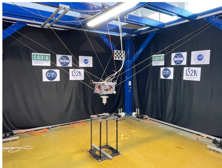
FIGURE 1 – CRAFT 's prototype located at LS2N, Nantes, France.

The cable-driven parallel robot prototype, named CRAFT is located at LS2N, France. The base frame of CRAFT is 4 m long, 3.5 m wide, and 2.7 m high, see Figure 1 a). The three-DoF translational and the three-DoF rotational motions of its suspended moving-platform ( MP ) are controlled with eight cables being respectively wound around eight actuated reels fixed to the ground. The MP is 0.28 m long, 0.28 m wide, and 0.2 m high, its overall mass being equal to 5 kg.