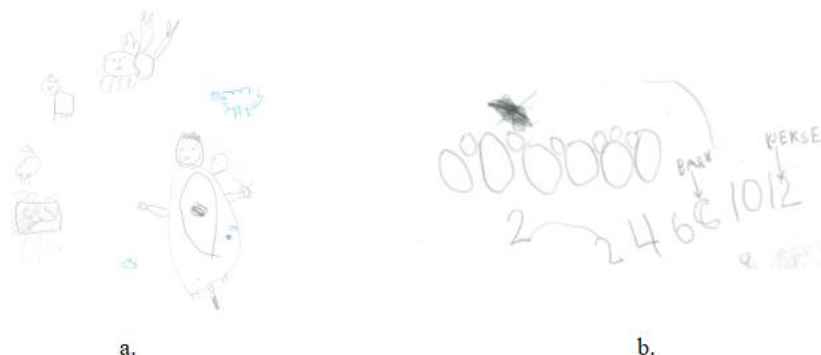
Figure 2a - Imagery and 2b – Visual aspects