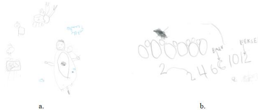
Figure 2a - Imagery and 2b – Visual aspects