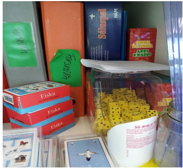
Figure 2 – Cards, dices and other games

Most of the resources are oriented towards counting and playing , and a few that are used in relation to measuring , while the other fundamental activities are based on pages from the mathematics textbook.