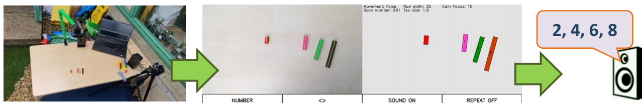
Figure 2: The app processes a webcam feed of rods placed on a tabletop and ‘speaks’ the lengths

In a local primary school in southwest England, Year 1 children (aged 5-6), who were not familiar with Cuisenaire rods, were invited individually to play a ‘game’ with rods, the app and a researcher, where the researcher challenged the children to ‘make it say’ certain numbers or sequences, such as the number five, or the two times table, or a sum, by placing rods on the tabletop. The children have to infer by experiment the ‘rules’ of which utterance is triggered by the placement of which rod. The tabletop block play was video recorded and the dialogue, and images grabbed by the app, analysed.