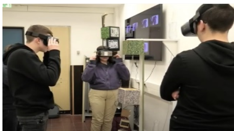
Fig.1 Students with AR headsets

Augmented reality (AR) is an innovative technology that combines layers of virtual objects or information about physical objects from the real world, such as texts, images, graphs, etc. This creates a kind of augmented reality, in which virtual objects and a real environment coexist to increase the learning experience (Arvanitis et al., 2009; Dunleavy et al., 2009). These virtual layers are created in real-time and layered on the physical objects in the real environment in 3D. Insofar as it augments mathematical representation with the real phenomenon, we assume that AR technology may play an essential role in engaging students in covariational reasoning, due to its ability to visually present information that is naturally invisible. It also simplifies objects' visual appearance and helps students think about their symbolic representations.