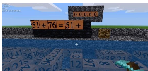
Figure 2: A Swimming Pool minigame

The minigames in Swimming Pool (Fig. 2) consist of a pool full of block numbers from 0 to 100 and an open number sentence. The goal is to find the correct block number within the pool and place it in the sentence. The first half of Swimming Pool minigames contains an open number sentence with two operations and one missing number, whereas the second half presents expressions with parenthesis and two or more different operations.