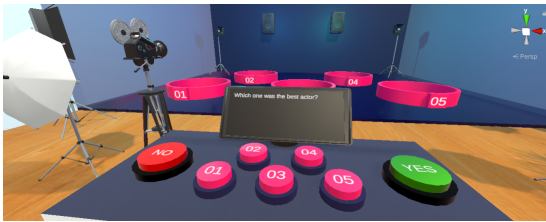
Fig. 2. The interactive smart table.

We propose a VR adaptive game called ImCasting , where the user can teach nonverbal behaviour to ECAs in the context of a movie casting. The player takes the role of a movie director, who is looking for an actor to play the role of a masked character in a silent movie. The director has to hire the actor who better performs an emotion with the upper part of the body and get rid of the bad ones who try to invade their audition through different rounds of the game. Amongst the actors, some are real humans and others are virtual agents (Fig. 1.A). The characters that represent human actors play a prerecorded performance, while the virtual ones generate a performance Proximal Policy Optimization reinforcement learning algorithm implementation from the Unity ML-Agent’s plugin, in real-time.