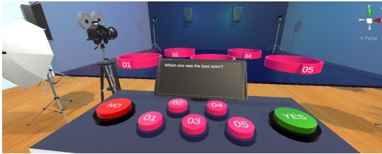
Fig. 2. The interactive smart table.

We propose a VR adaptive game called ImCasting , where the user can teach nonverbal behaviour to ECAs in the context of a movie casting. The player takes the role of a movie director, who is looking for an actor to play the role of a masked character in a silent movie. The director has to hire the actor who better performs an emotion with the upper part of the body and get rid of the bad ones who try to invade their audition through different rounds of the game. Amongst the actors, some are real humans and others are virtual agents (Fig. 1.A). The characters that represent human actors play a prerecorded performance, while the virtual ones generate a performance Proximal Policy Optimization reinforcement learning algorithm implementation from the Unity ML-Agent's plugin, in real-time.