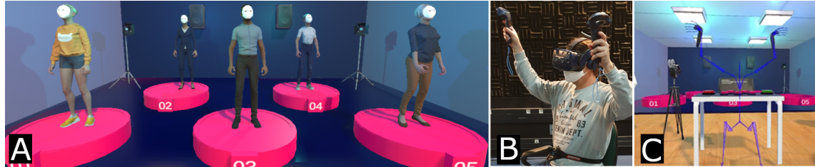
Fig. 1. The ImCasting game virtual environment: A) The main stage of the audition room shows all of the five actors standing on the trapdoors with their masks on waiting to be judged by a player as the movie director after their performance; B) The player is able to express different emotions (e.g., joy emotion in this figure) to give an example to the system at the beginning of the game; and C) The skeleton of the player's avatar reproduces this upper body motion in the virtual world.

BRIAN RAVENET, University Paris-Saclay, CNRS, LISN, CPU Team, France