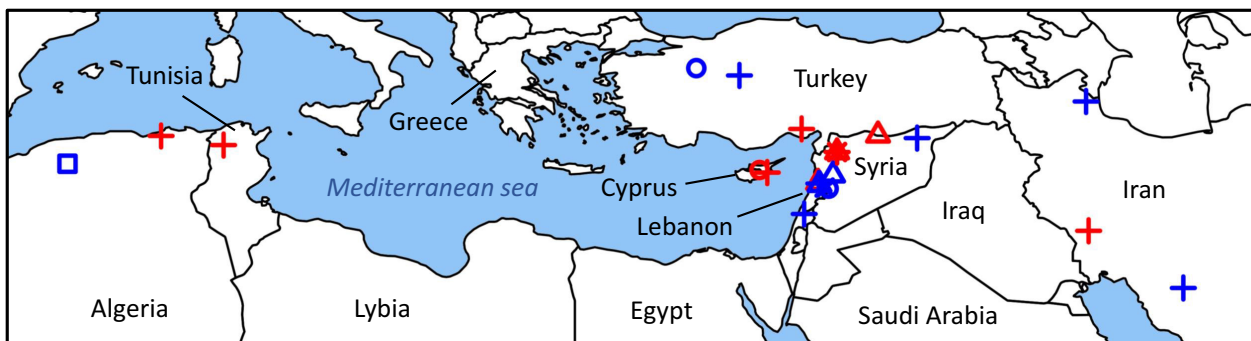
FIGURE 1 Map of the locations of the 26 Puccinia striiformis f. sp. tritici isolates studied, from eight Mediterranean and Middle Eastern countries of origin. Symbols indicate genetic groups: PstS0 (square), NW European; PstS3 (x), Mediterranean–Middle Eastern; PstS1 (circle); PstS2 (+) and PstS1/S2 (triangle), Middle East–East African. PstS1 and PstS2 (PstS1/S2) were not distinguished using the SCAR marker. Red/blue symbols indicate low altitude (<400 m.a.s.l.)/high altitude (>400 m.a.s.l.) origin, respectively.

We classified local conditions first according to altitude (warm <400 m.a.s.l. and cold >400 m.a.s.l.); this classification was confirmed by mean temperature from February to May, the growing season for wheat in the Mediterranean and Middle Eastern region. We also classified the isolates into six classes: <200, 200–400, 400–600, 600–800, 800–1000 and \geq 1000 m.a.s.l. This made it possible to assess diversity of aptitude to temperature conditions and to determine whether isolates from low-altitude areas performed better than those from higher altitude areas at warmer temperatures.