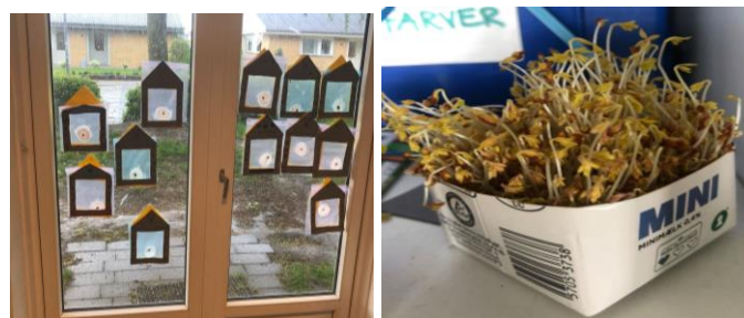
Figure 2. Pictures of growing seeds: a) sunflower; b) watercress

A first-grade activity called Plants and Germination was developed in one of the laboratories. The focus was on sunflowers and watercress and what their seeds needed in order to grow. The activity began with a walk in the woods, focusing on observing normal conditions for the plants in the forest. Each student was then given a sunflower seed to embed in a cotton ball in a plastic bag, each of which was then taped onto the classroom window, resembling a cardboard greenhouse (see Figure 2a). Each student then kept a schedule of how many millimetres the plant grew from day to day. Additionally, watercress seeds were sown in milk cartons (see Figure 2b), which were positioned in different places in the classroom, with or without light and with more or less water.