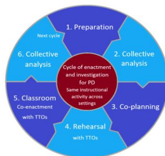
Figure 1: Cycle of enactment and investigation for PD (Wæge & Fauskanger, 2021)

Sociocultural views on teacher learning inform the presented study which draws on a description of learning, thinking and knowing as “relations among people engaged in activity in, with, and arising from the socially and culturally structured world” (Lave, 1991, p. 67). We see learning cycles as contexts for having reasoned dialogues (i.e, dialogues where everyone engages critically but constructively with each other’s ideas and where everyone’s ideas are treated as worthy of consideration) providing “affordances for changing participation and practice” and thus opportunities for the participants to learn (Greeno & Gresalfi, 2008, p. 172). Opportunities to learn is understood as emerging in activities, and from this perspective, teacher learning includes developing the ability to engage in particular practices. Learning cycles (Figure 1) were designed to engage teachers in learning professional noticing.