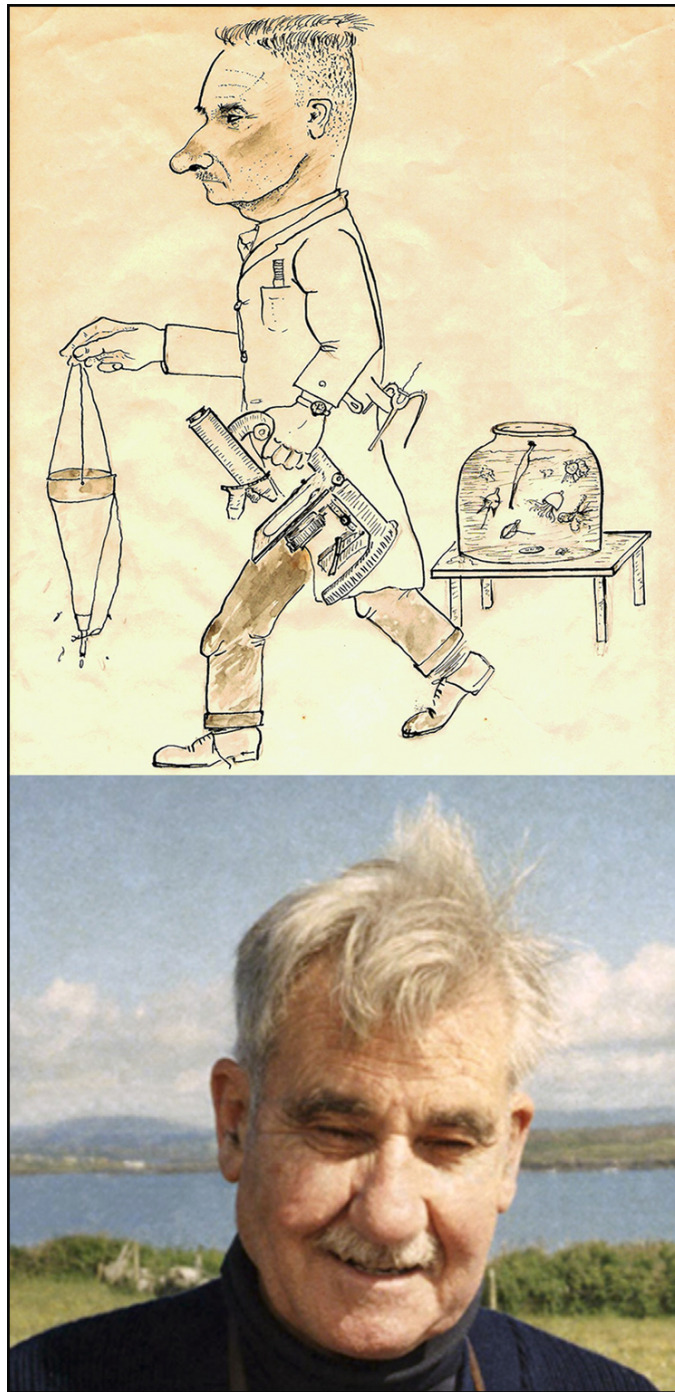
Fig. 1. Enrique Balech, as depicted by himself likely in the 1950's (a colored version given to Andrés Boltovskoy by Balech) and Balech in 1985 at conference on harmful algae in St. John's, NB, Canada.