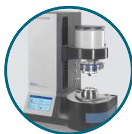
Thermo Scientific™ HAAKE™ MARS™ iQ rheometers for comprehensive QC needs

From development to quality control – reliable analyzes with versatile, innovative instruments increase your productivity and maintains quality standards. Thermo Scientific Rheometers meet these requirements: Ease of use, measurement and evaluation software for beginners and professionals, extensive accessories for every application.