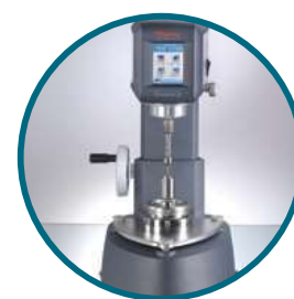
Entry level Thermo Scientific™ HAAKE™ Viscotester™ iQ, the portable rheometer for flexible QC tasks

Learn more at thermofisher.com/qcrheometers