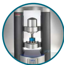
Thermo Scientific™ HAAKE™ MARS™ rheometers for advanced QC and applied R&D demands