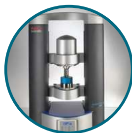
Thermo Scientific™ HAAKE™ MARS™ rheometers for advanced QC and applied R&D demands