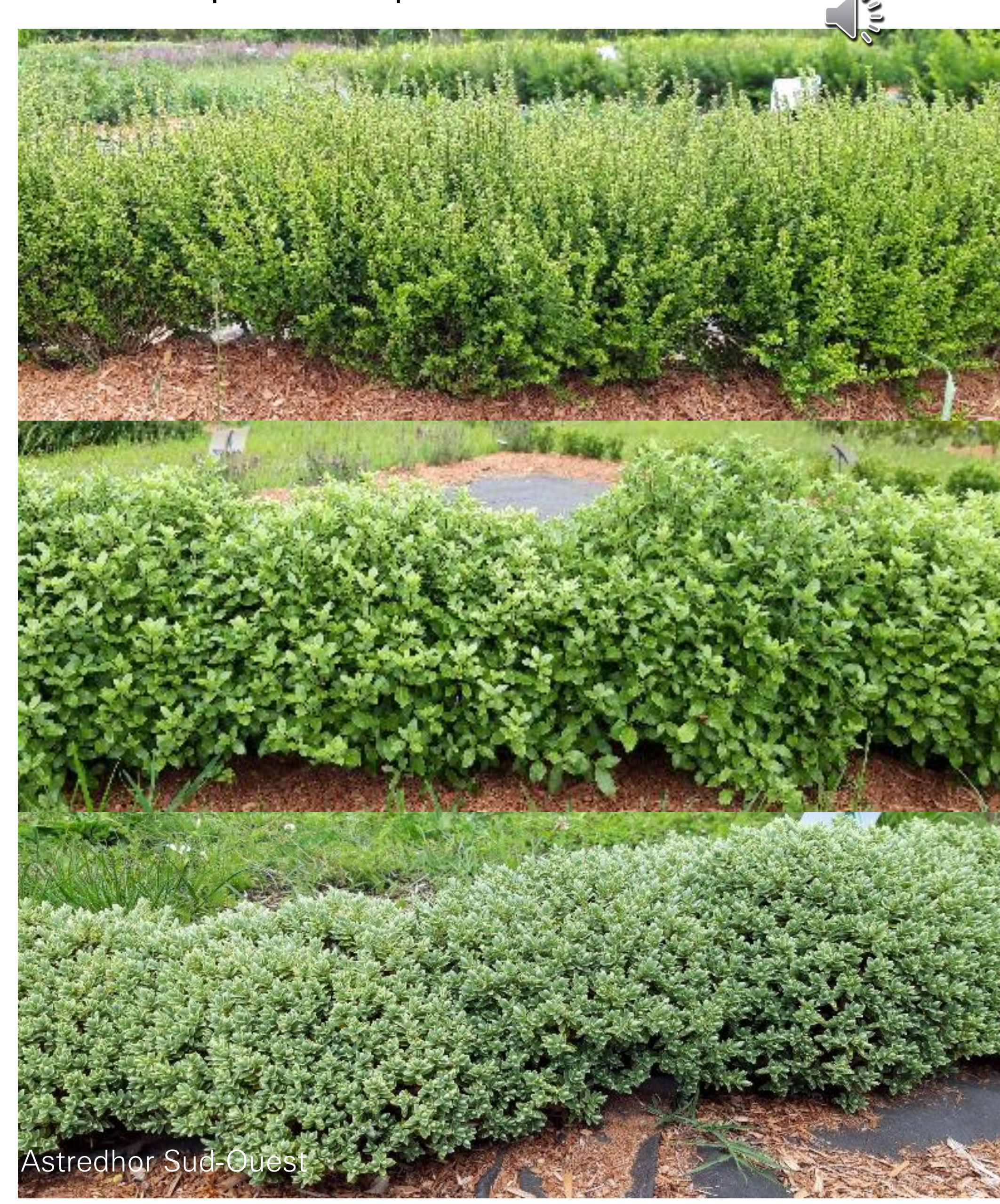
Fig 3 (a) Lonicera nitida 'Scoop', (b) Pittosporum tenuifolium 'Midget'and (c) Hebe pinguifolia 'Sutherlandii' hedges in Spring 2021

Finding a species that can present all the boxwood seems advantages of the impossible task. Nevertheless, some of them can be an interesting solution if the local conditions are compatible with the needs of the taxa and managers are willing to spend more time to manage their hedges.