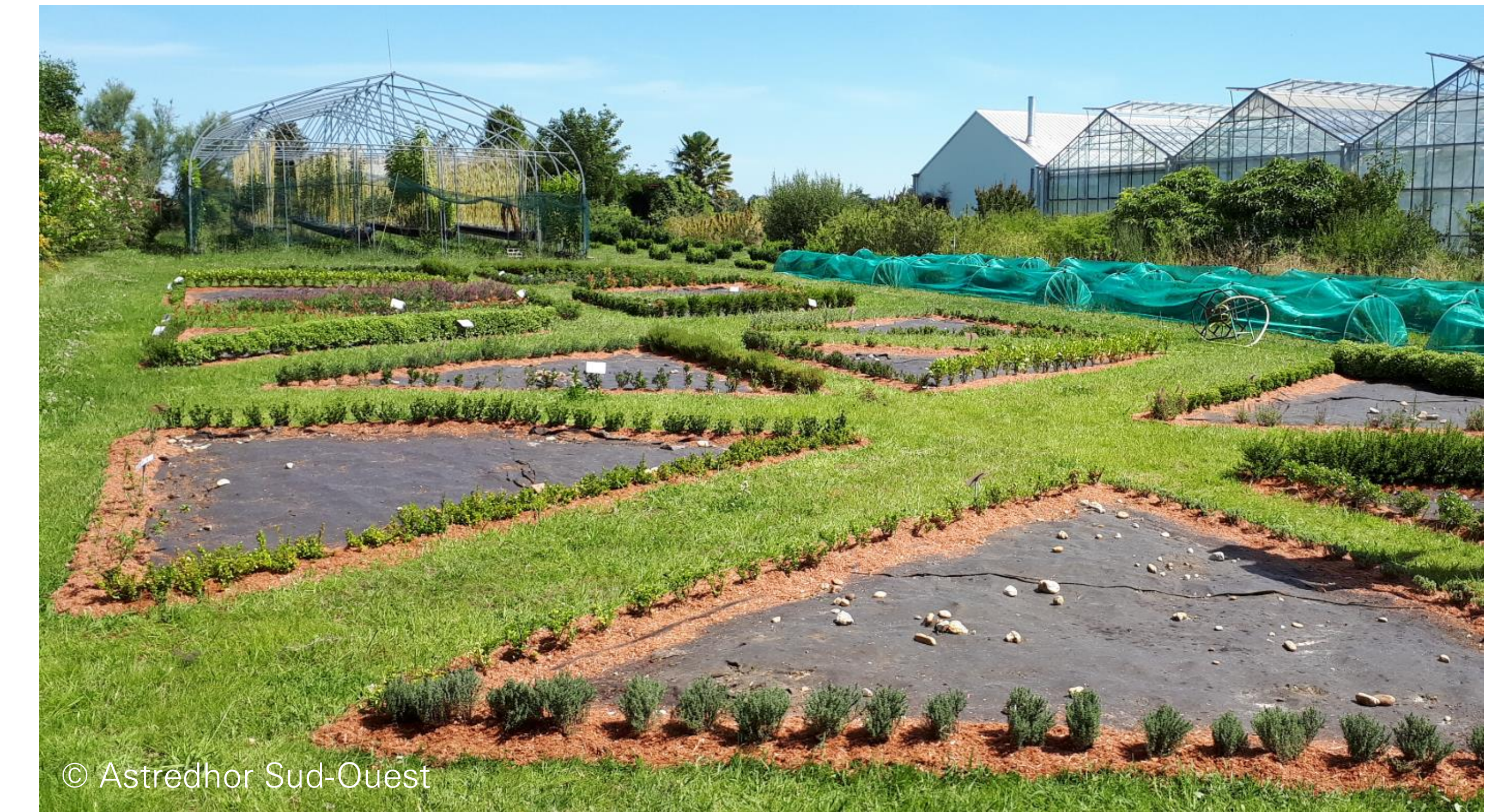
Fig 1 Experimental field at Astredhor Sud-Ouest