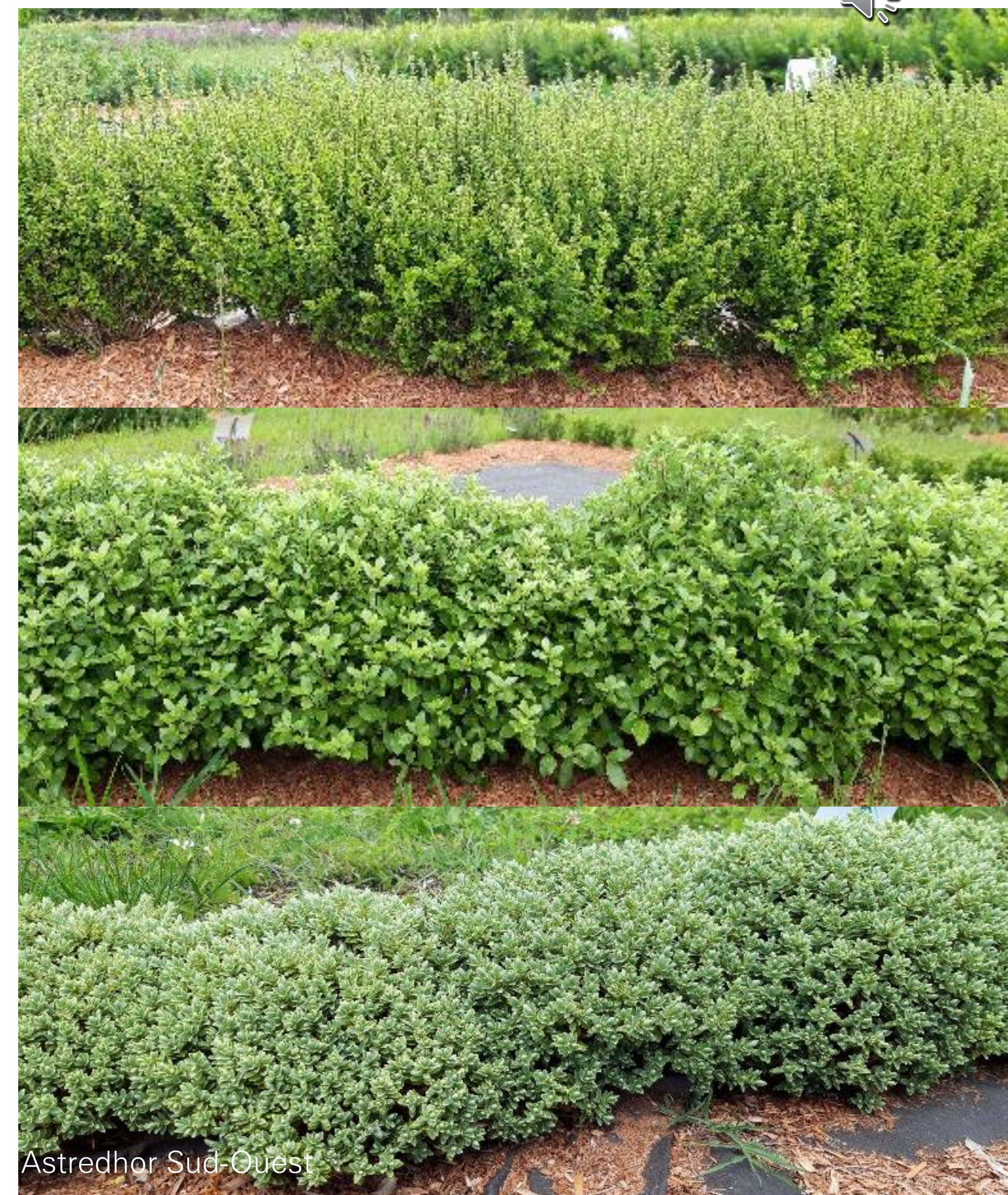
Fig 3 (a) Lonicera nitida 'Scoop', (b) Pittosporum tenuifolium 'Midget' and (c) Hebe pinguifolia 'Sutherlandii' hedges in Spring 2021

Finding a species that can present all the advantages of the boxwood seems an impossible task. Nevertheless, some of them can be an interesting solution if the local conditions are compatible with the needs of the taxa and managers are willing to spend more time to manage their hedges.