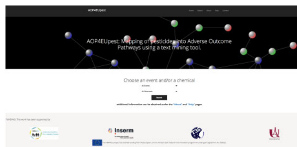
Fig. 1. Interface of the search page of the web application AOP4EUpest ( http://www.biomedicale.parisdescartes.fr/aop4EUpest/home.php )

AOP-helpFinder 2 was applied to a list of pesticides prioritized by HBM4EU partners because of the lack of knowledge on their long-term health effects, and their exposure levels in humans (Supplementary Table S1). For each pesticide, an individual screening of the PubMed database that contains 30 072 881 articles (as of August 21, 2019) was performed. All abstracts related to one pesticide were saved in .xml files. A dictionary of events extracted from the AOP-Wiki ('aop_ke_mie_ao.tsv' file, as of August 26, 2019) was developed and used to carry out the abstracts text mining (Supplementary Table S2). This dictionary contains information regarding 165 MIEs, 704 KEs, 125 AOs, 12 MIE/KE (in the AOP-Wiki database an event can be defined as an MIE in one AOP and as a KE in another AOP) and 18 KE/AO (events defined as AO in some AOPs and as KEs in other AOPs) (Supplementary Table S2). Consequently, only abstracts co-mentioning a pesticide and at least one event were retrieved (Supplementary Table S1). pS and wS were calculated for each data pair as described previously in order to identify the most relevant scientific publications (Carvaillo et al., 2019).