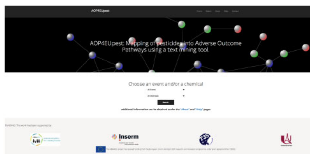
Fig. 1. Interface of the search page of the web application AOP4EUpest ( http://www.biomedicale.parisdescartes.fr/aop4EUpest/home.php )

AOP-helpFinder 2 was applied to a list of pesticides prioritized by HBM4EU partners because of the lack of knowledge on their long-term health effects, and their exposure levels in humans (Supplementary Table S1). For each pesticide, an individual screening of the PubMed database that contains 30 072 881 articles (as of August 21, 2019) was performed. All abstracts related to one pesticide were saved in .xml files. A dictionary of events extracted from the AOP-Wiki ('aop_ke_mie_ao.tsv' file, as of August 26, 2019) was developed and used to carry out the abstracts text mining (Supplementary Table S2). This dictionary contains information regarding 165 MIEs, 704 KEs, 125 AOs, 12 MIE/KE (in the AOP-Wiki database an event can be defined as an MIE in one AOP and as a KE in another AOP) and 18 KE/AO (events defined as AO in some AOPs and as KEs in other AOPs) (Supplementary Table S2). Consequently, only abstracts co-mentioning a pesticide and at least one event were retrieved (Supplementary Table S1). pS and wS were calculated for each data pair as described previously in order to identify the most relevant scientific publications (Carvaillo et al., 2019).