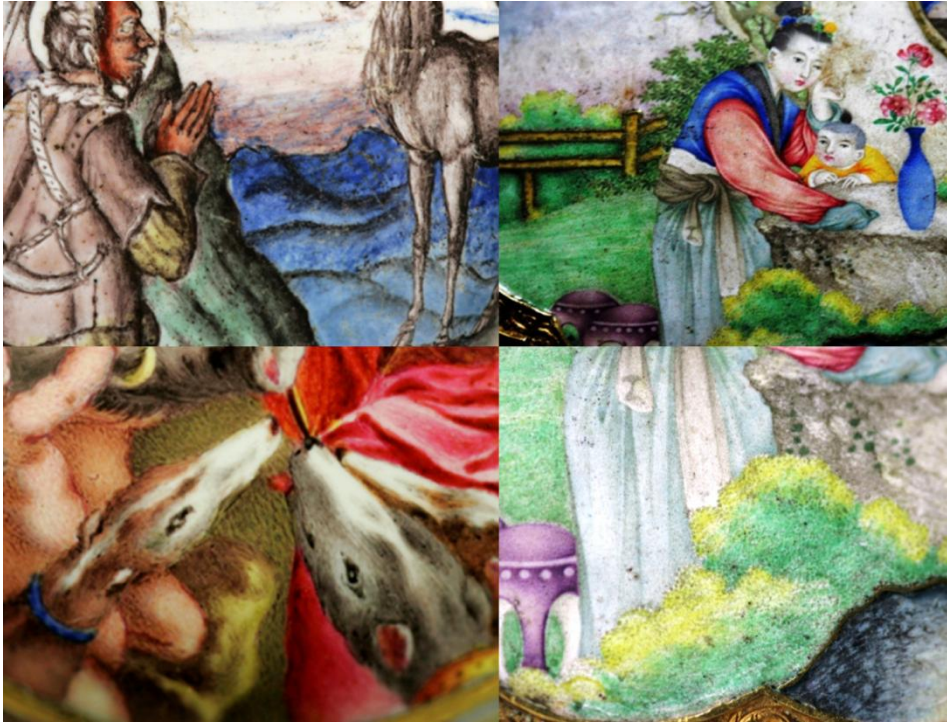
Fig. 3. Comparison of enamel decoration techniques: on the left, the transition from the technique of superimposing coloured layers (top, on a watch circa 1640, Paris, inv. OA7074) to the stippling technique (bottom, on a watch, 2nd half of the 18th century, Amsterdam, inv. OA6264) Louvre Museum Coll.; on the right, detail of an ewer decorated with cloisonné and painted enamels (Qianlong mark, 3rd quarter of 18th century, inv. F1467C, National Museum of Château de Fontainebleau (Chinese Museum), Fig. 3); note the use of the stippling technique.