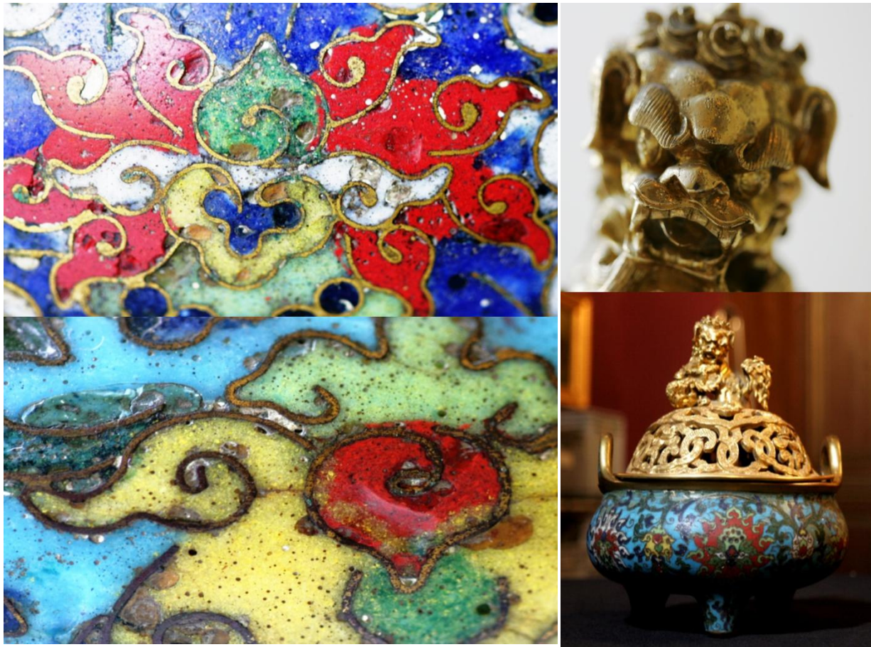
Fig. 2. Detail of the cloisonné enamels of an incense burner tripod (Kangxi reign; National Museum of Château de Fontainebleau (Chinese Museum)). Detail of the coloured areas. The green and yellow areas are opacified with cassiterite associated with Naples yellow type of pigments.

It is known that Ming Dynasty cloisonné enamels had been opacified by fluorite and not by cassiterite. This is the case for the white areas in this artefact: note that the Raman spectrum of this phase is very tiny and similar spectra are collected on blue areas. On the contrary the yellow-green and yellow areas are coloured and opacified by mixtures of Naples yellow and cassiterite. Cassiterite and Naples yellow pyrochlore typically point to European technologies/ingredients. This burner artefact is thus one of the first artefacts made with European recipes, but for some colours only.