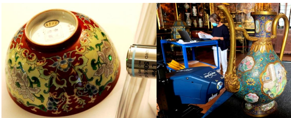
Fig. 1. Mobile non-invasive analyses (on the left by Raman microspectroscopy, on the right by pXRF) allow the remote analysis ( > 1 \text{ cm} between the probe head and the specimen surface) of different areas to be accomplished. The laser spot give a good visual approximation to the point of analysis which is actually much smaller than the visible halo spot; the example on the left shows an imperial huafalang bowl with the reign mark "Yongzheng yu zhi" (inv. G 4806, National Museum of Asian Arts-Guimet Coll.) and on the right a gold ewer decorated with cloisonné and painted enamel with the Qianlong mark (inv. F1467C, National Museum of

Figure 1 demonstrates that the operational distance between the object's surface and the Raman or XRF instrument does not require the direct contact between the specimen and the probe head.