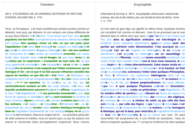
Figure 1. Text-PAIR interface showing differences in the article “Air”.

Once settled on the optimal parameters, we then used Text-PAIR to generate both an alignment database, for interactive examination, and a set of static results tables. The alignment database contains some 7,304 aligned passage pairs. The system allows queries on metadata, such as author and article title as well as words or phrases found in the aligned passages. Each aligned passage is presented as a facing page representation and the user can toggle a display of the variations between the two aligned passages. As seen below, the variations between the texts can be extensive (fig. 1).