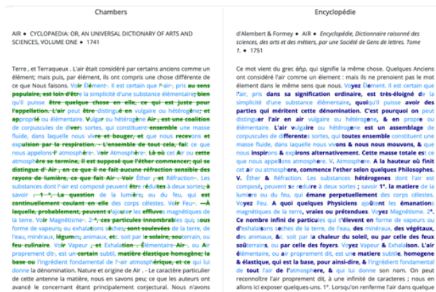
Figure 1. Text-PAIR interface showing differences in the article “Air”.

Once settled on the optimal parameters, we then used Text-PAIR to generate both an alignment database, for interactive examination, and a set of static results tables. The alignment database contains some 7,304 aligned passage pairs. The system allows queries on metadata, such as author and article title as well as words or phrases found in the aligned passages. Each aligned passage is presented as a facing page representation and the user can toggle a display of the variations between the two aligned passages. As seen below, the variations between the texts can be extensive ( fig. 1 ).