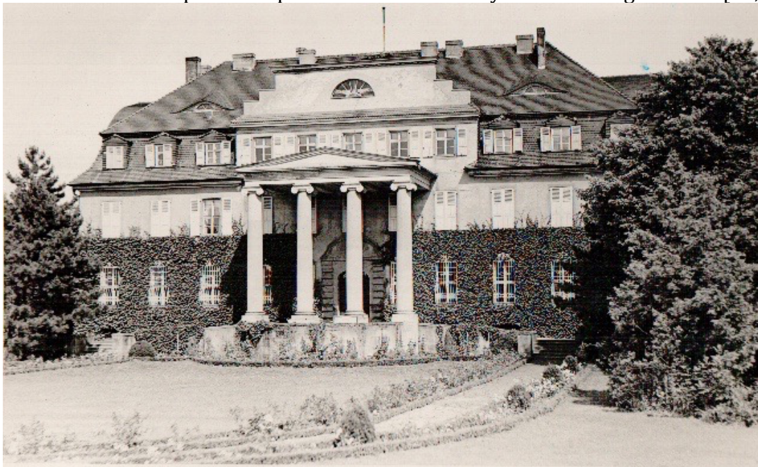
Figure 2. Szelejewo Pałac (postcard, c.1928)