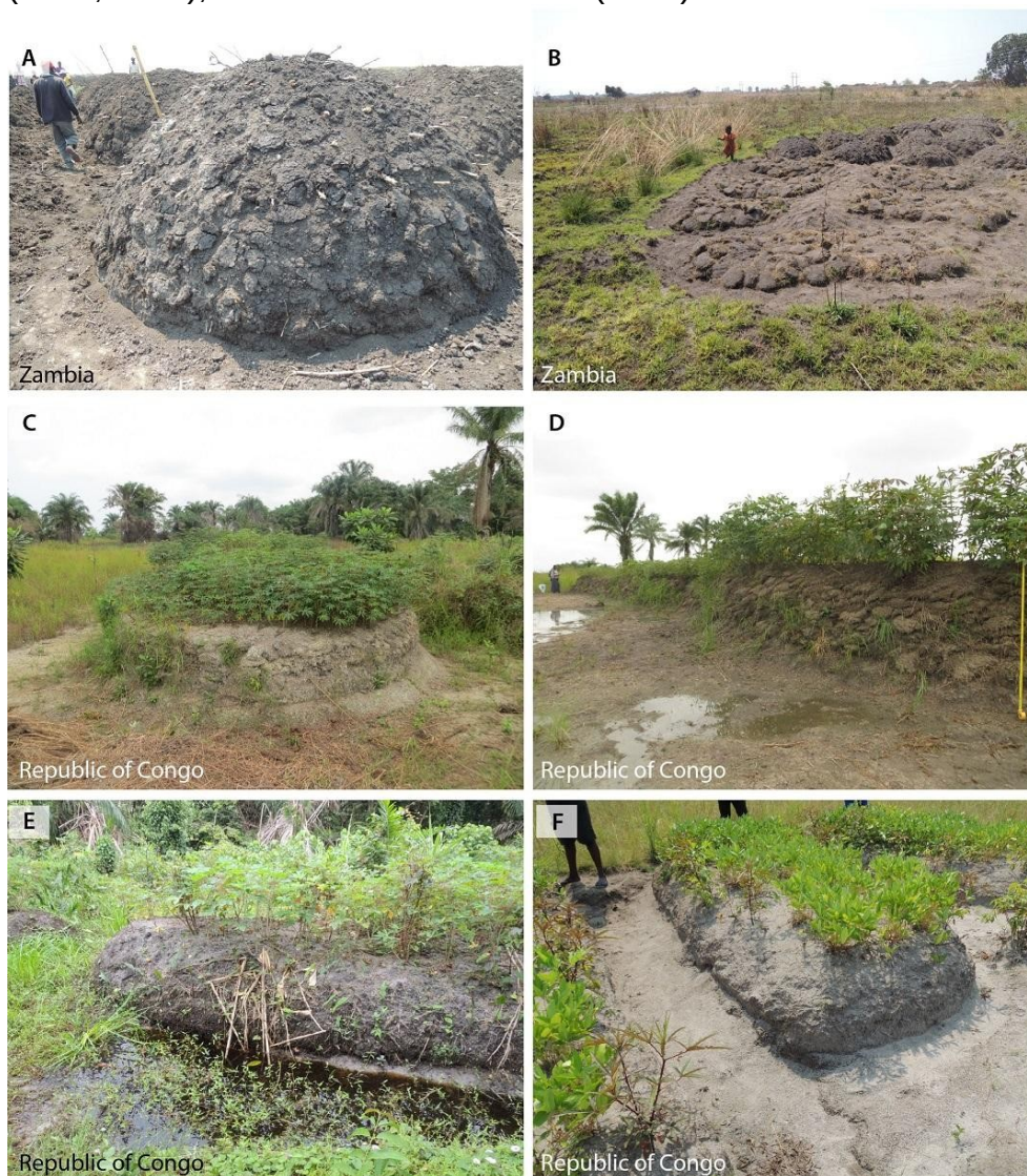
Figure 3. Raised fields in an upland forested area near Matiti, French Guiana, revealed by forest removal.

Images of present-day RFs in New Guinea can be seen in Denham (2018), Sillitoe (1998, 2013), and Taraken and Ratsch (2009).