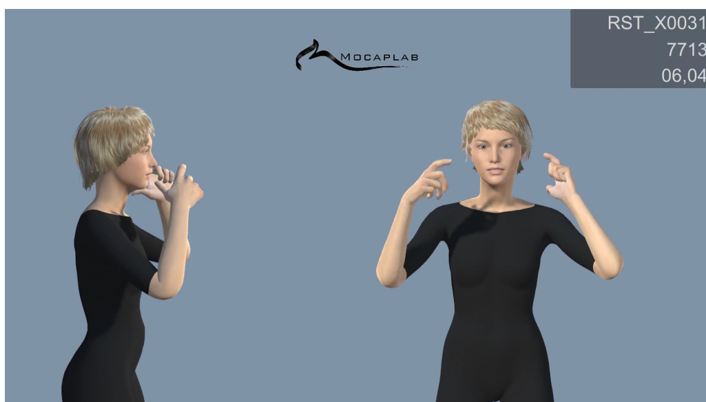
Figure 1: Avatar rendering