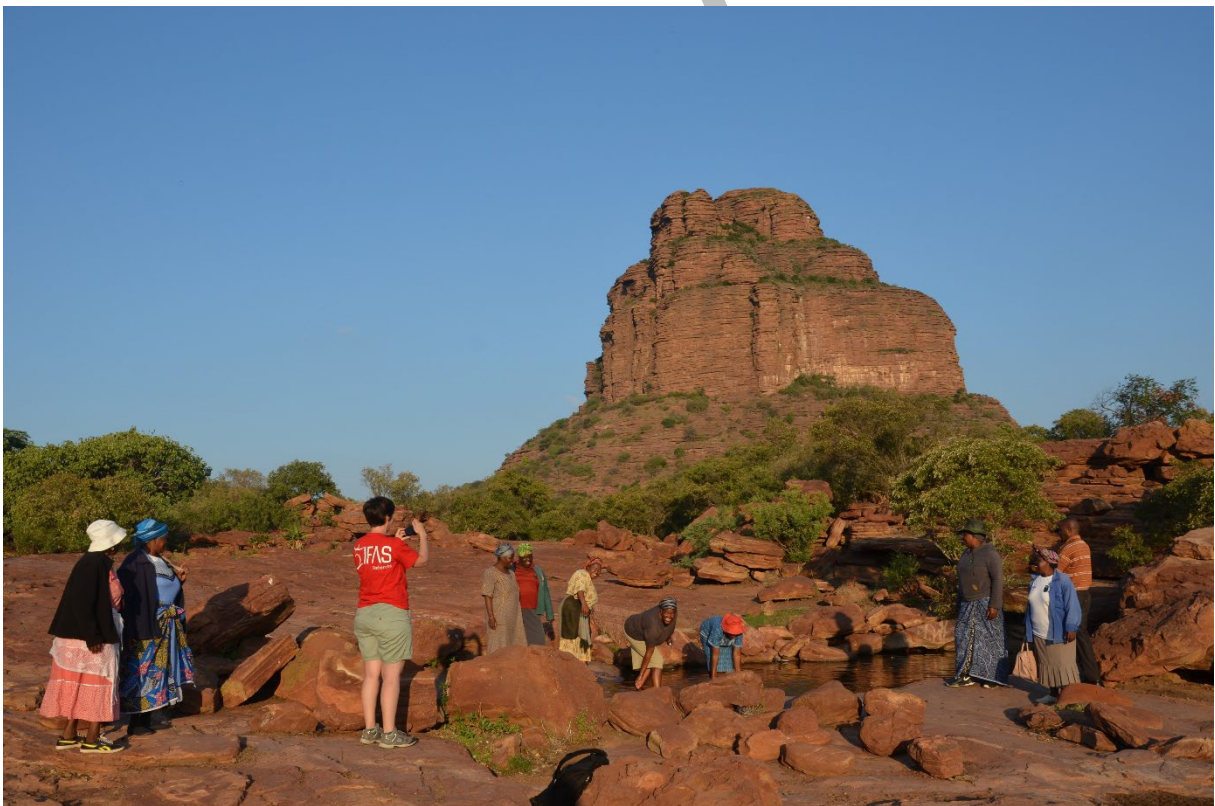
FIG. 6. Members of the research team relaxing with community members at the foot of Thabananhllana mountain. April 2019, M. Duval