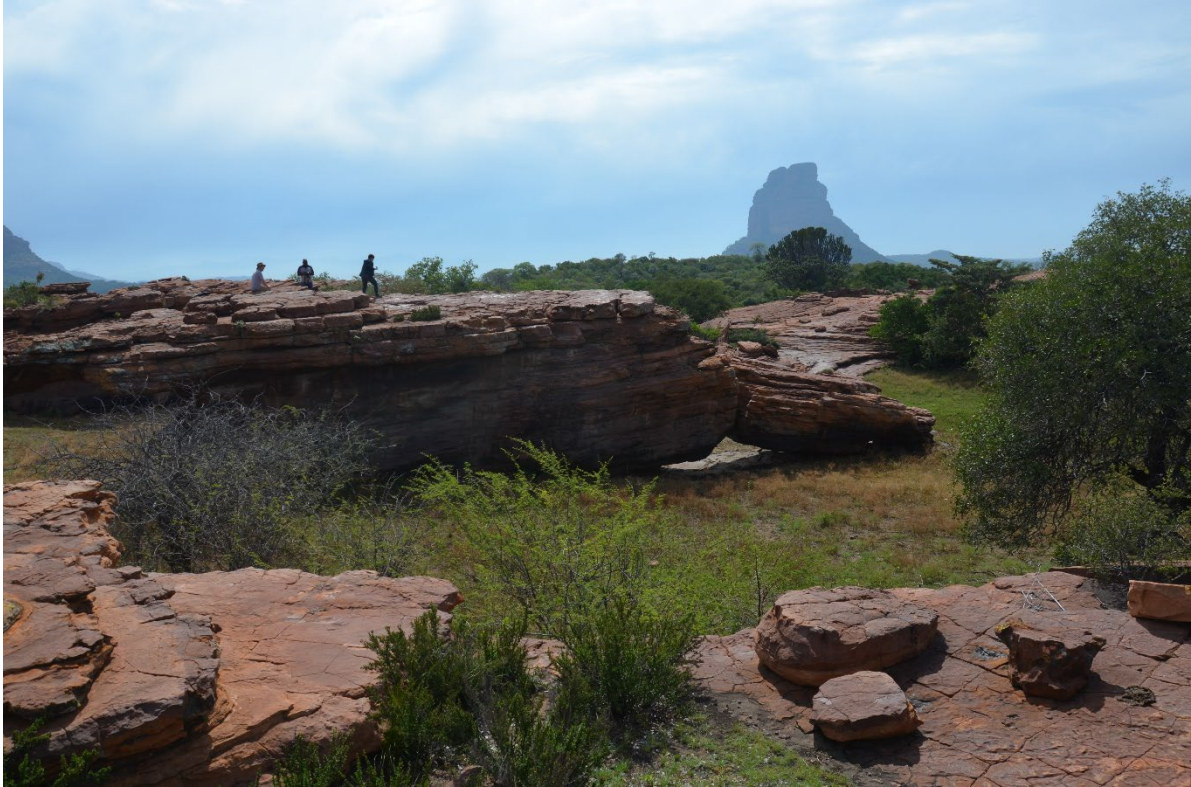
FIG. 2. View across the ruiniform landscape of the Makgabeng to Thabananhlanga mountain. Thabananhlanga village lies at the foot of the mountain. April 2019