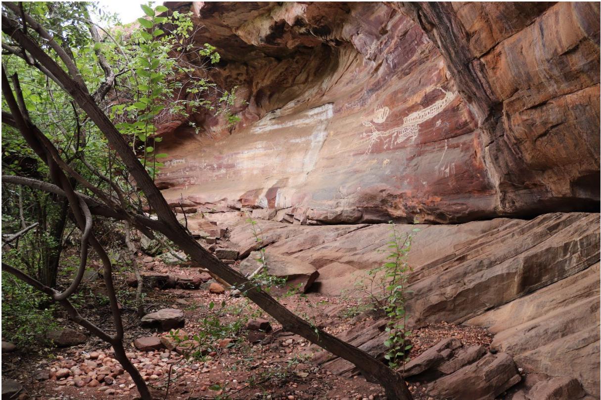
FIG. 5. The Great Train shelter is a northern Sotho rock art site. March 2020, C. Namono