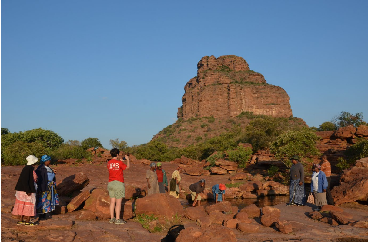
FIG. 6. Members of the research team relaxing with community members at the foot of Thabananhllana mountain. April 2019, M. Duval