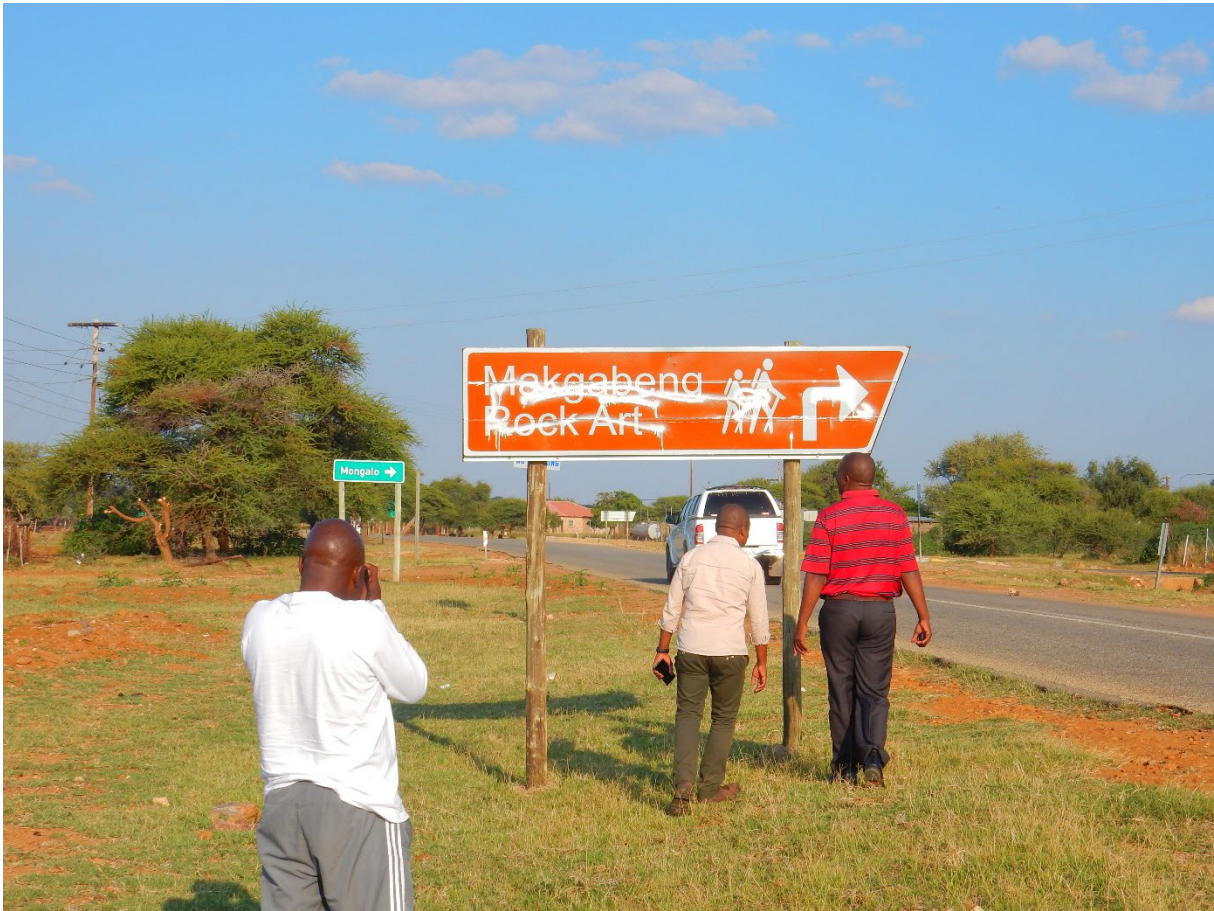
FIG. 8. Partially defaced tourist sign to the Makgabeng on the main road from Senwabarwana. April 2019, A. Nivart