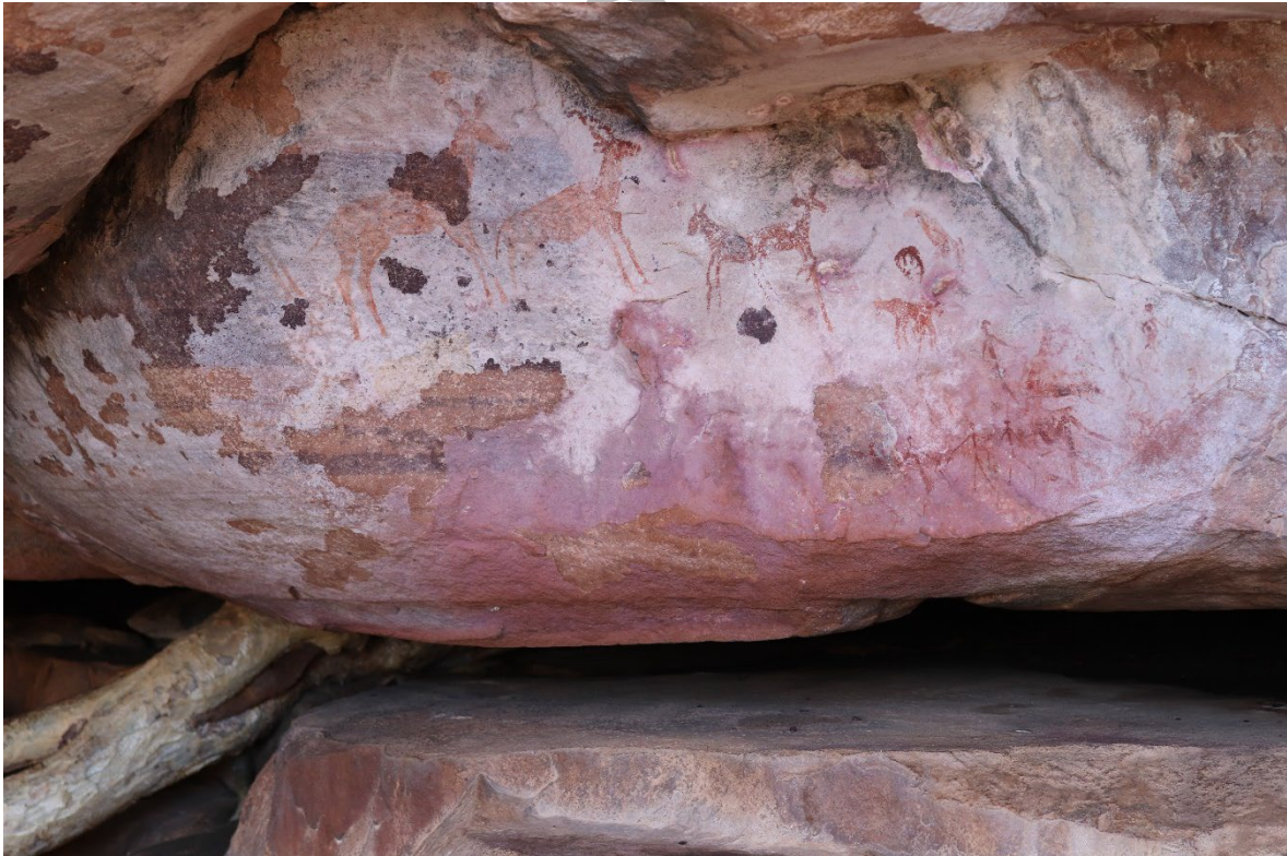
FIG. 3. The Too Late shelter, also called Medicine Dance shelter, is a San rock art site. March 2020, C. Namono