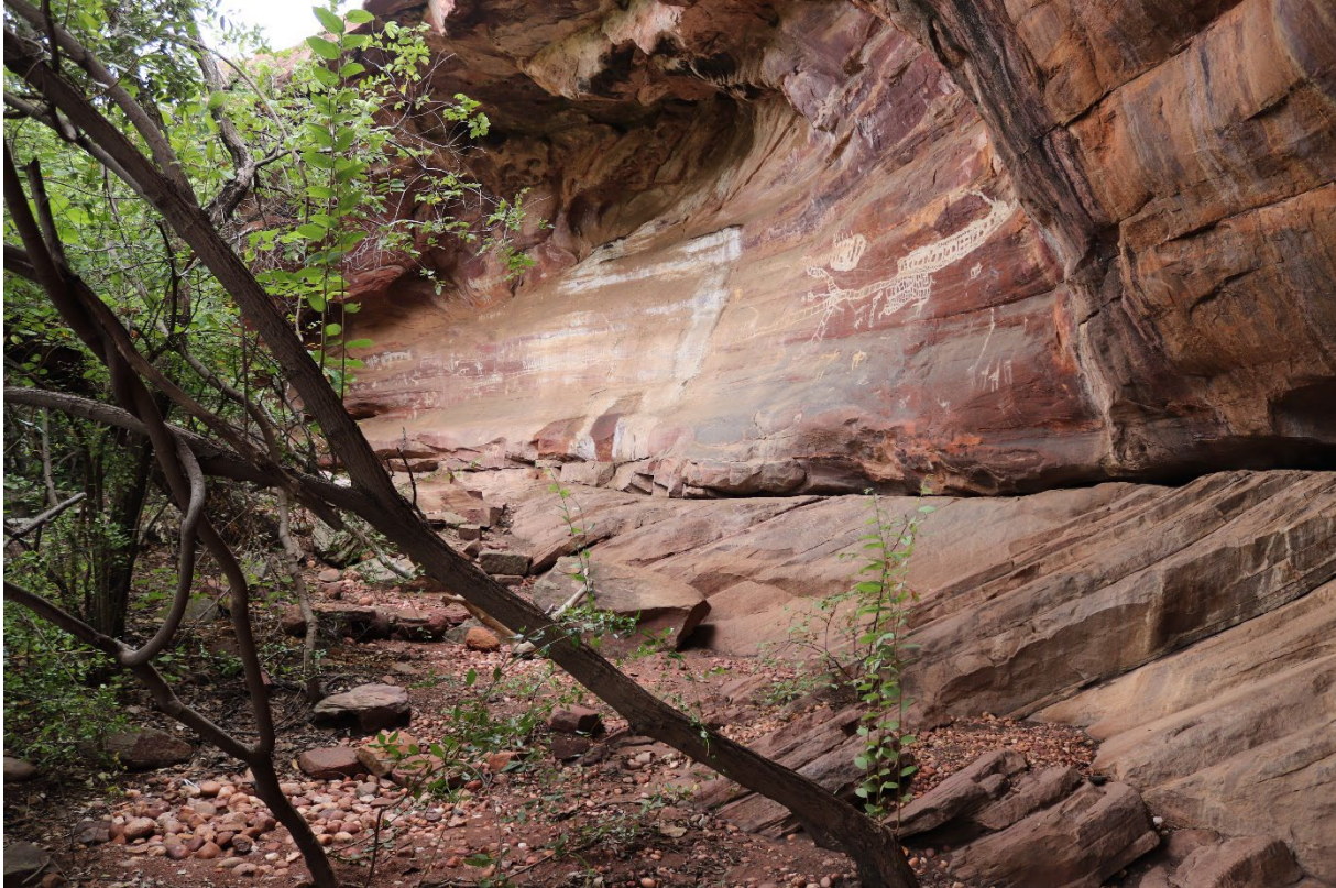
FIG. 5. The Great Train shelter is a northern Sotho rock art site. March 2020, C. Namono