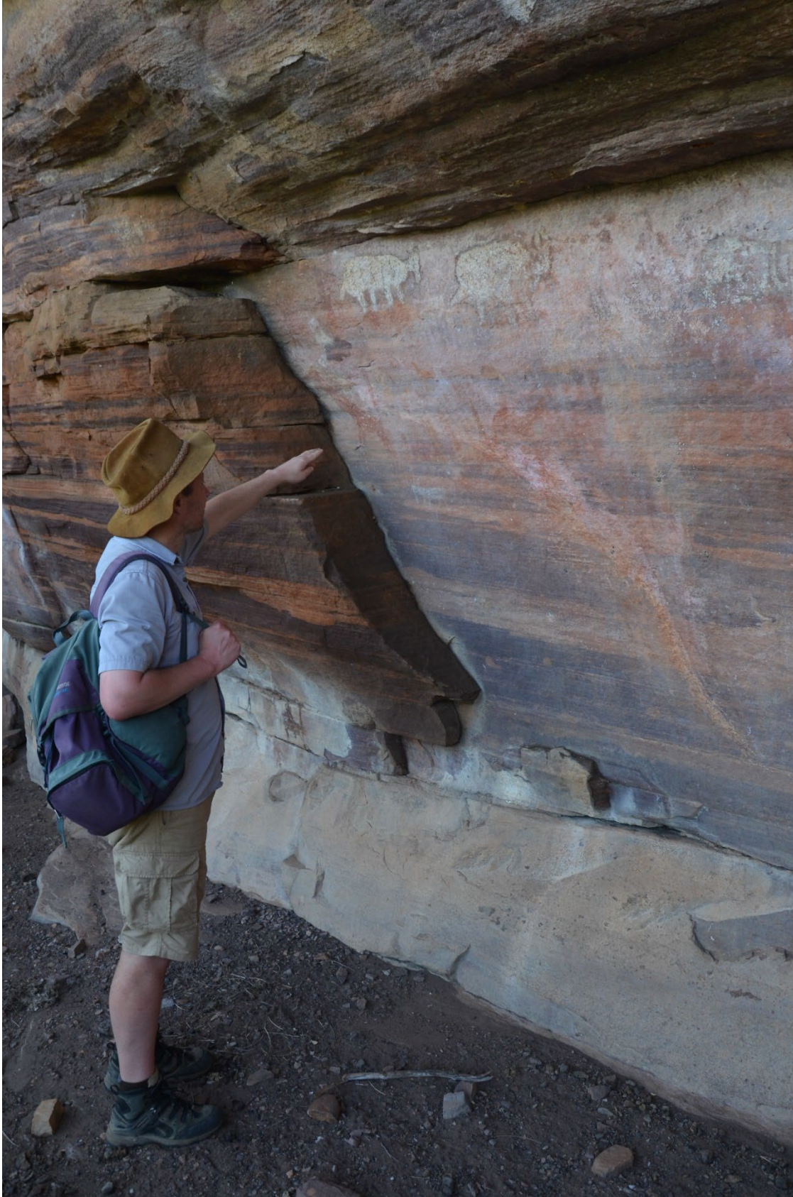
FIG. 4. The Khoi Paintings shelter, is a Khoekhoen rock art site. April 2019, M. Duval