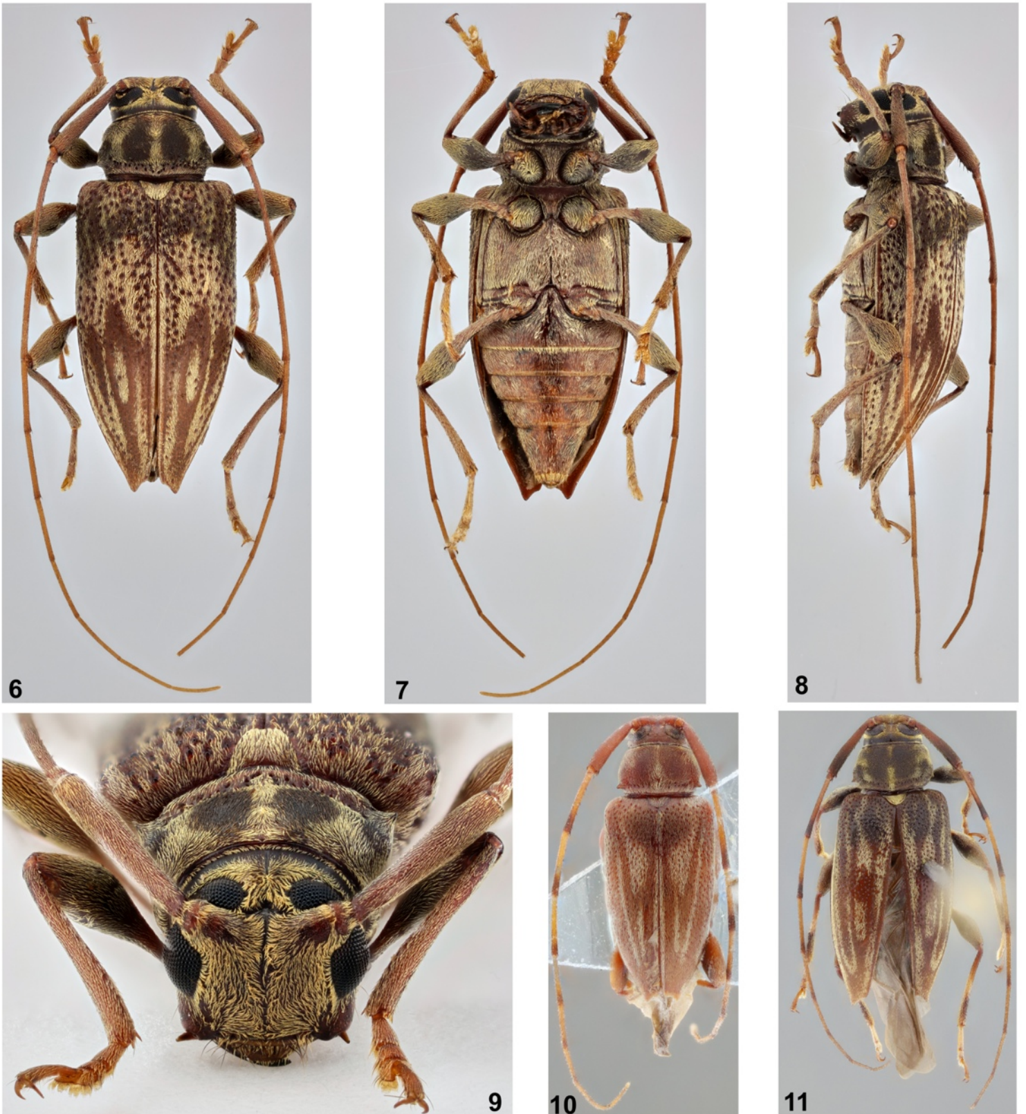
Figures 6-11. Lepturges ( L. ) spp.

6-9. Lepturges ( L. ) caldensis , holotype ♀. 6. Dorsal habitus. 7. Ventral habitus. 8. Lateral habitus. 9. Head, frontal view.