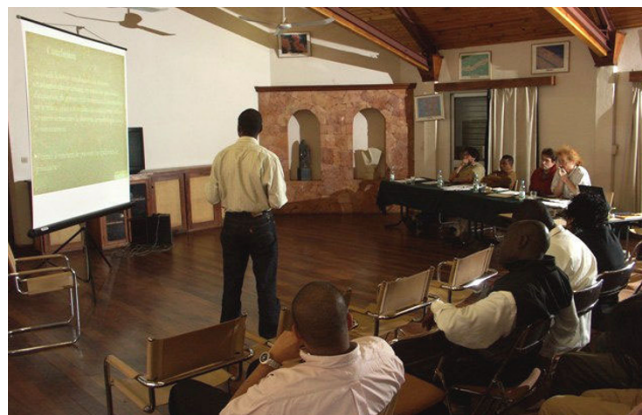
Figure 1 Presentations to the panel. Footnote: The presentations are given at the end of the week, in front of the other participants and the panel, composed of tutors. These sessions allow the participants to demonstrate their acquisitions, by defending their approach, and aim to evaluate the work done during the week.

Details concerning the timetable for this course are published on the course website [1].