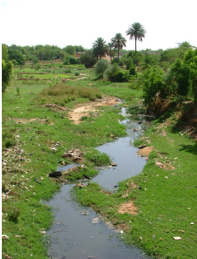
Figure 3 View of the Gountou Yena stream. Picture taken in Niamey during early wet season (june 2008), showing the small stream surrounded by small-scale gardening areas (top-left) where kdr frequency within An. gambiae M form larvae was particularly high

cides. Unreliable precipitation and limited commercial demand tend to keep the use of inputs such as chemical fertilizer, pesticides and hired labour to a minimum [64]. However, several localized mosquito populations might experience more pyrethroid exposure, especially in irrigation and gardening zones where agricultural production demands and allows financially insecticide use. Urban domestic use of pyrethroids for personal protection was also suggested to favor the emergence of resistant individuals within mosquito populations [29,39]. Indeed, the highest kdr frequencies ever detected in M forms were found around important cities in Côte d'Ivoire [43] and Benin [19,35,44], corroborating the hypothesis of high insecticide pressure within urban environments. In addition, it seems that M form populations breeding inside the city of Niamey also present high kdr-w frequencies, far greater than any analysed rural site. Some of the sampled larval populations were breeding near a small stream that crosses the city and is surrounded by year-round vegetable cultivation areas. We therefore cannot