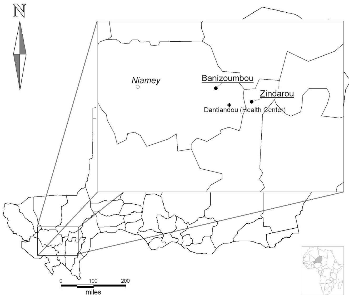
Figure 1 Study sites. Map of Niger with the larger insert for the study zone showing the relative situation of villages to the Capital, Niamey. Scale bars for the Niger map.