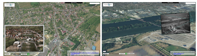
Figure 2: Visualization with 2 geolocation types: left, the view, associated with toponym "Chalendrey" converted in 2D geolocation, is displayed in the 3D scene by simple overlay, before semi-automatic geolocalization; right, the view (Nanterre) is 6-DoF localized and displayed in the camera pyramid model, around which the user can turn freely.

In the perspectives, we plan to study other descriptors to further improve image retrieval, especially in challenging conditions (aerial vs. ground-level, etc.) as well as improve the user experience between the two platforms for geolocalization.