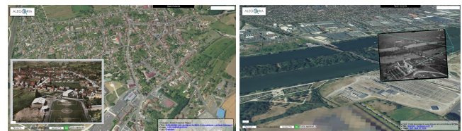
Figure 2: Visualization with 2 geolocation types: left, the view, associated with toponym "Chalendrey" converted in 2D geolocation, is displayed in the 3D scene by simple overlay, before semi-automatic geolocalization; right, the view (Nanterre) is 6-DoF localized and displayed in the camera pyramid model, around which the user can turn freely.

In the perspectives, we plan to study other descriptors to further improve image retrieval, especially in challenging conditions (aerial vs. ground-level, etc.) as well as improve the user experience between the two platforms for geolocalization.