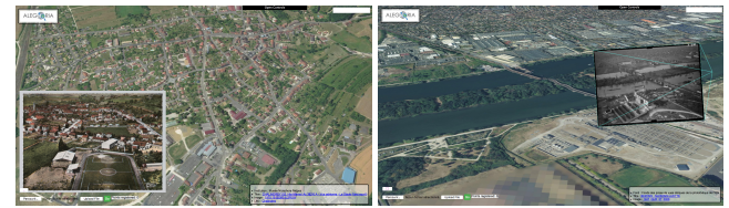
Figure 2: Visualization with 2 geolocation types: left, the view, associated with toponym "Chalendrey" converted in 2D geolocation, is displayed in the 3D scene by simple overlay, before semi-automatic geolocalization; right, the view (Nanterre) is 6-DoF localized and displayed in the camera pyramid model, around which the user can turn freely.

In the perspectives, we plan to study other descriptors to further improve image retrieval, especially in challenging conditions (aerial vs. ground-level, etc.) as well as improve the user experience between the two platforms for geolocalization.