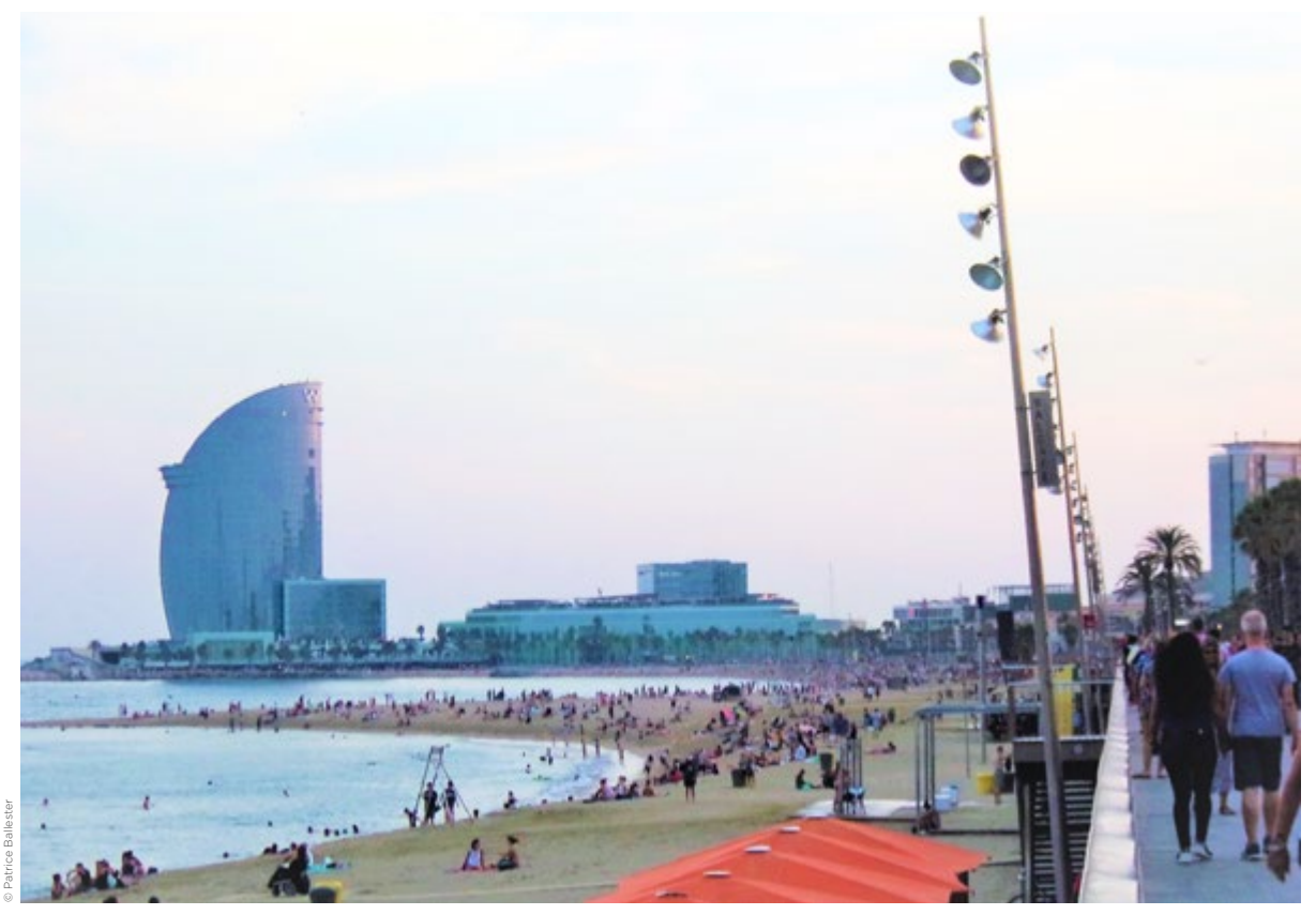
A new tourist coastline, sea passage, in Barcelona (Spain).

The Olympic Port and Port Vell projects are emblematic of the new post-Olympic Barcelona. The city's relationship with the sea has been reversed. It is not entirely true that the city was turning its back on the sea, if you consider the importance of the port and seaside beach-clubs at the beginning of the twentieth century. But the most important rights-of-way and urban wastelands full of public services such as warehouses and a railway were located along the coast, and these were