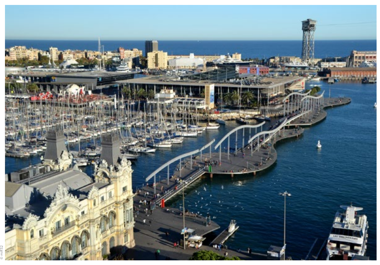
Old Port of Barcelona (Spain).

The most important work can be found in telecommunications and underground urban planning through a complete wiring of the city to European standards, and the creation of business zones with a fast connection to the rest of the world. The urban transformations are significant and surround the four new centralities, but also reach across the new airport, large landscaped parks (Creuta del Coll) and the Collselora telecommunications tower, not to mention the upgrading of the postal public services and, less significantly, the sports infrastructure of FC Barcelona.