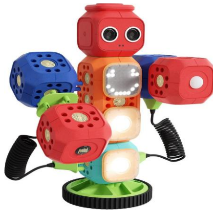
Figure 1. Robo Wunderkind modular robot