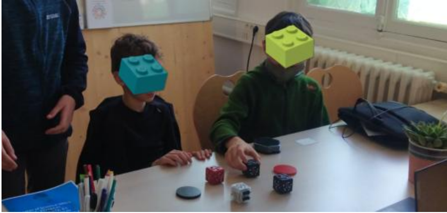
Figure 3. Children playing the CreaCube task with Cubelets.