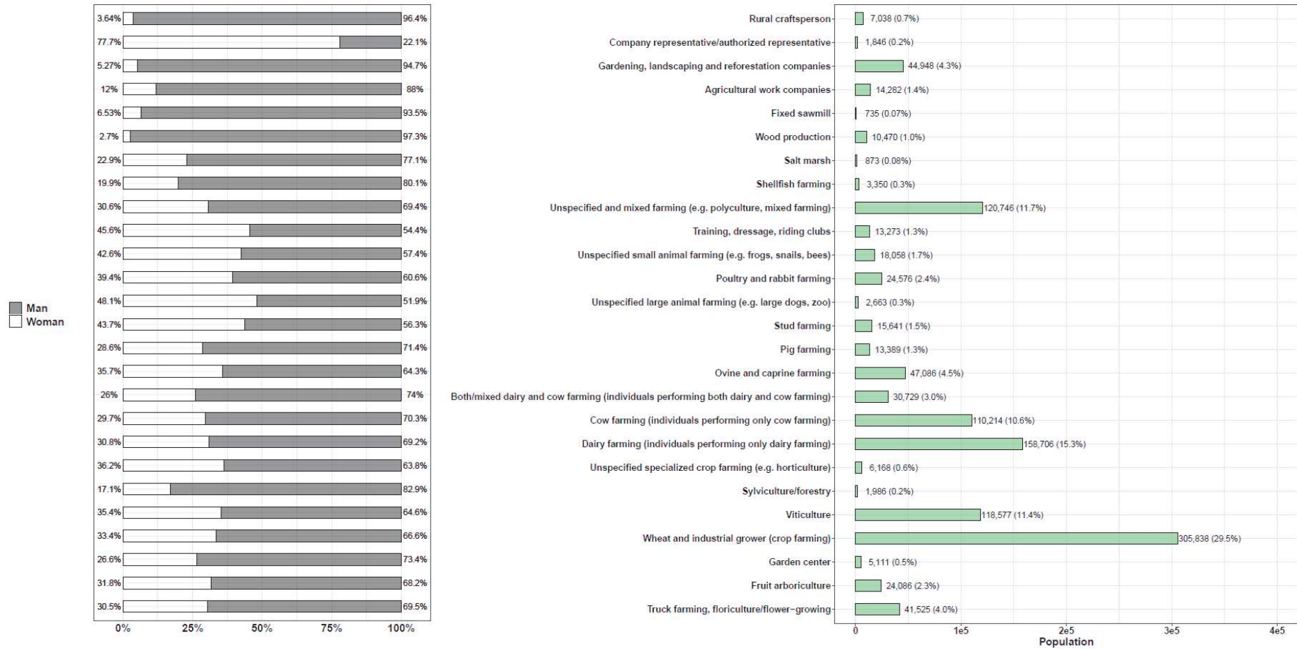
Fig. S1: Number of farm managers by agricultural activities and sex