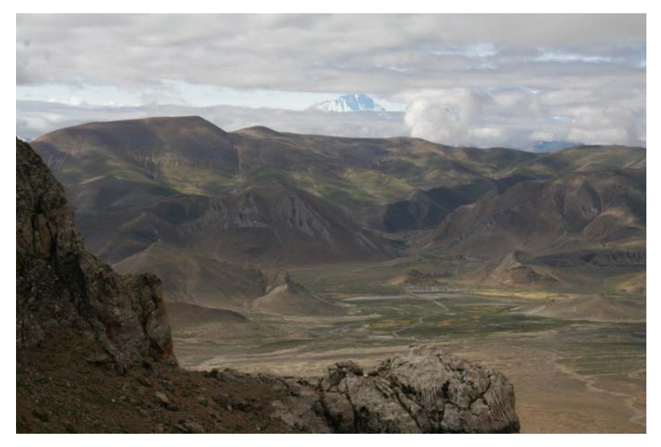
Fig. 1 — Ding ri seen from rTsib ri mountain (photo M. Sernesi, 2016).

provides the background from which these teachings emerged, detailing the lineages and textual transmissions received by Yang dgon pa. It shows how he was trained in all the main practice traditions of his time, out of which he modeled his unique approach.