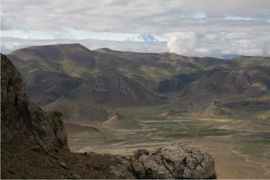
Fig. 1 — Ding ri seen from rTsi ri mountain (photo M. Sernesi, 2016).

provides the background from which these teachings emerged, detailing the lineages and textual transmissions received by Yang dgon pa. It shows how he was trained in all the main practice traditions of his time, out of which he modeled his unique approach.