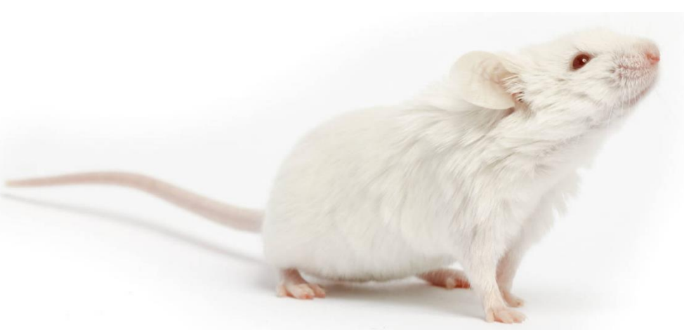
FVB/N mouse, The Jackson Laboratory