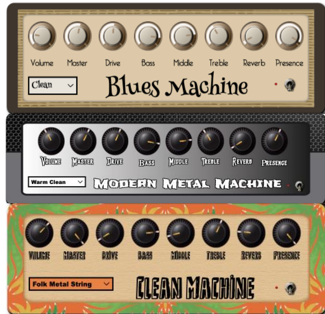
Figure 3 : the three guitar amplifier simulators WAM plugins

These plugins are now commercialized by our laboratory. They can be seen as "premium versions with extra features" of other open source projects we already published [16-19]. For example, the Amp Designer that has been used for designing these plugins, as well as a previous version of the Blues Machine amp simulator (named Distortion Machine) plugin are available as open source projects 2 and you can see other videos of these versions 3 .