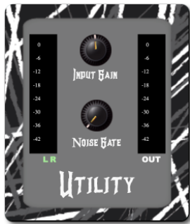
Figure 1 : The AmpSim Utility plugin is useful for adjusting input gain and merging/muting left and right channels. It also includes a multi-channel noise gate.

We propose to present a set of web audio plugins specialized in three kinds of sounds.... The first one targets blues / classic rock sounds and proposes a drop down menu with presets that go from clean warm blues like the tones used by BB King, to more classic rock/blues distorted sounds used by Jimmy Hendrix or AC/DC. The second one is aimed to Hi Gain/Metal sounds similar Mesa Boogie type sounds, and the third one is an acoustic guitar simulator (use an electric guitar and get an acoustic folk guitar sound). These plugins are partially available in open source, but the versions we propose to demo are commercialized by our laboratory (French CNRS/SATT Sud-Est) and included in some commercial DAWs.