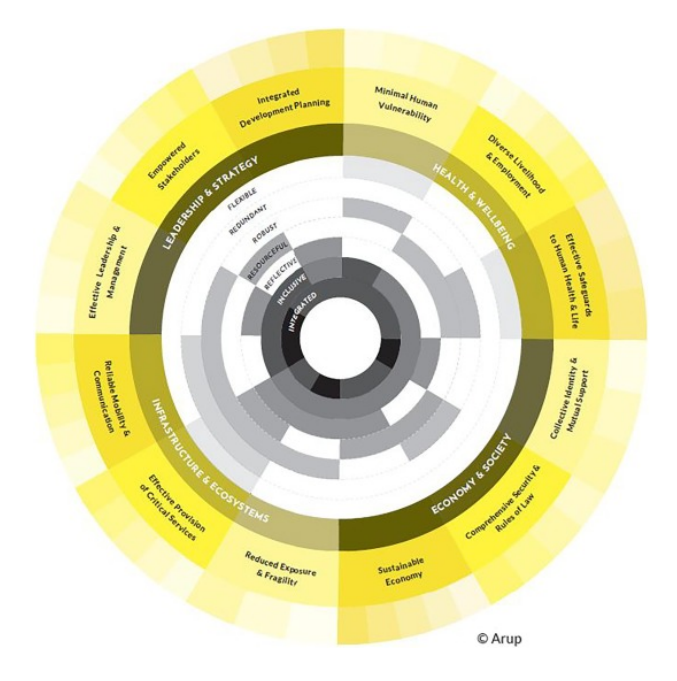
Figure 1. An example of the City Resilience Index [1], where the filled inner rings assess performance. The darkest color represents "very poor" and lightest color represents "excellent."

The overall evaluation method, called the City Resilience Index, developed by Arup and the Rockefeller Foundation [1] under the 100 resilient cities program allows considering several hazards. Figure 1 provides a comprehensive view of the four dimensions to consider in building resilience: health and well-being, economy and society, infrastructure and ecosystems, governance and strategy. Each of these dimensions includes several goals (for a total of 12 goals), each of which may be evaluated according to several indices (for a total of 52 indices).