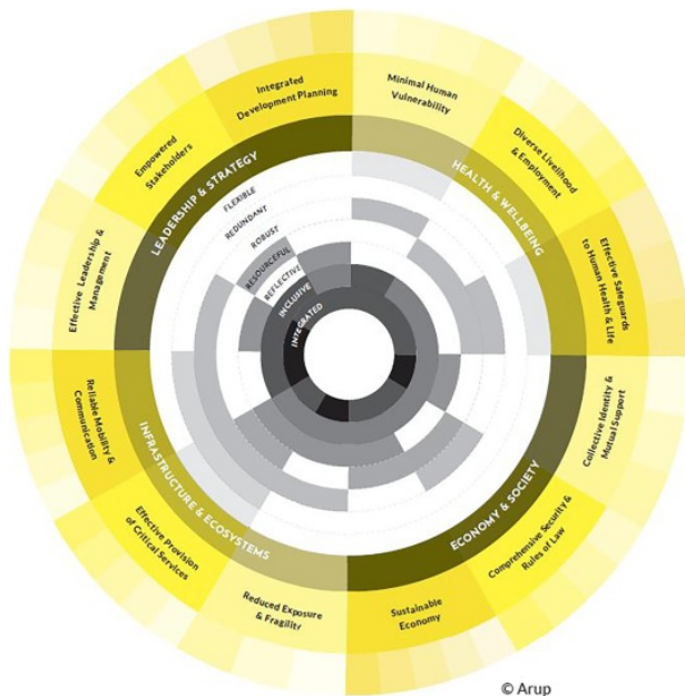
Figure 1. An example of the City Resilience Index [1], where the filled inner rings assess performance. The darkest color represents “very poor” and lightest color represents “excellent.”

The overall evaluation method, called the City Resilience Index, developed by Arup and the Rockefeller Foundation [1] under the 100 resilient cities program allows considering several hazards. Figure 1 provides a comprehensive view of the four dimensions to consider in building resilience: health and well-being, economy and society, infrastructure and ecosystems, governance and strategy. Each of these dimensions includes several goals (for a total of 12 goals), each of which may be evaluated according to several indices (for a total of 52 indices).