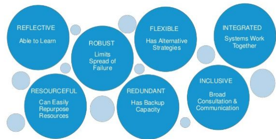
Figure 2. Qualitative attributes of a resilient system [1]

Each indice can be evaluated according to the qualitative resilience-enhancing attributes shown in Figure 2.