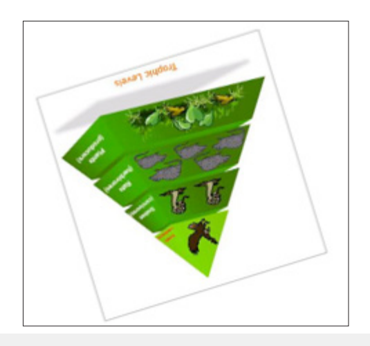
Figure 1: Trophic chain.

of the trophic chain because if they are present, it means that the rest of the trophic chain is in good condition (Figure 1).