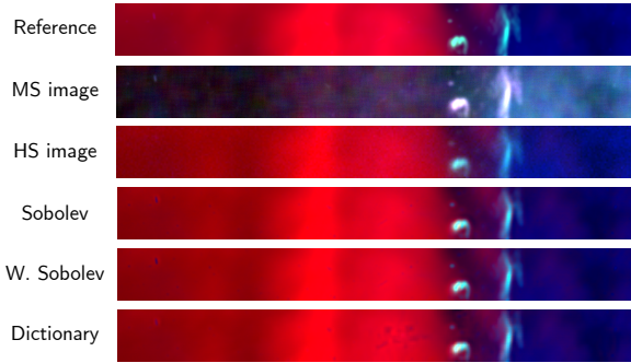
Fig. 1. RGB compositions of the reference image, the multispectral observed image, the hyperspectral observed image and fused products with the Sobolev, the weighted Sobolev and the dictionary-based regularizations.