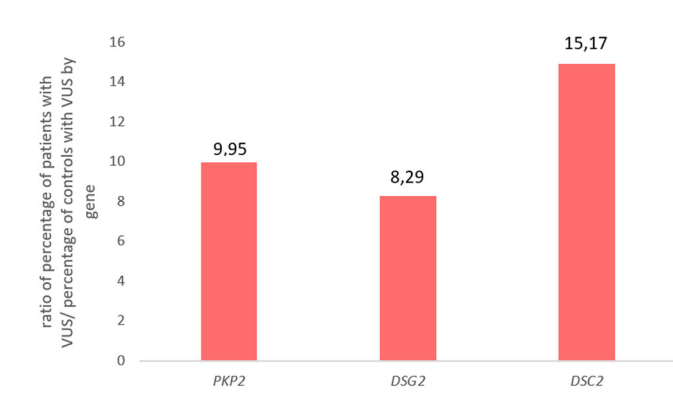
FIGURE 2 Ratio of the percentage of patients with uncertain significance variants (VUS)/percentage of controls with VUS by genes. PKP2 , DSG2 , and DSC2 are significantly enriched in VUS in arrhythmogenic cardiomyopathy with right dominant form cases compared to controls.

Among the 11 genes of the panel associated with ACR, only seven genes ( PKP2 , DSP , DSG2 , DSC2 , JUP , TMEM43 , and RYR2 ) present PV and LPV. Predominantly, these are genes encoding for the desmosomal complex ( PKP2 , DSC2 , DSG2 , JUP , and DSP ). The distribution of VUS shows genes encoding for desmosomal proteins and also for calcium-regulating proteins. No PV, LPV, and VUS were found in PLN and LMNA genes. Similarly, none of the other genes in the panel associated with cardiomyopathies or arrhythmia (Supporting Information: Data) present PV or LPV in our patient set.