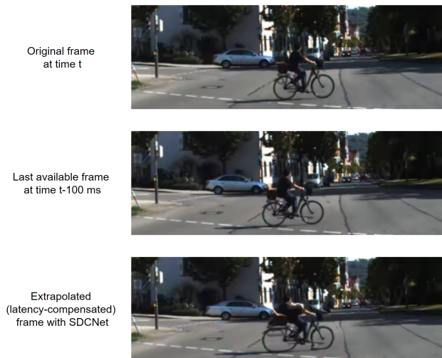
Fig. 3. Qualitative results for a latency compensation of 100 ms. The extrapolation at decoder side scheme is used. The HEVC codec uses a quantization parameter QP = 32 .

The distortion between displayed and original frames is evaluated using three objective metrics: PSNR in the YCbCr color space [18], SSIM [19], and VMAF [20]. This yields a rate-distortion curve for each possible extrapolation horizon (latency compensation) h . We compare all curves to the case h = 0 , i.e. , without any extrapolation. The average quality losses over different rates, expressed by the negative Bjøntegaard delta metric (BDPSNR, BDSSIM and BDVMAF), are reported in Table 2, where the first numbers are the BD metric values for the extrapolation at the decoder side, and the numbers in parentheses are the differences with respect to this scheme when using extrapolation at the encoder. We can observe that extrapolation at the encoder/decoder produces essentially the same quality losses for a given amount of compensated latency.